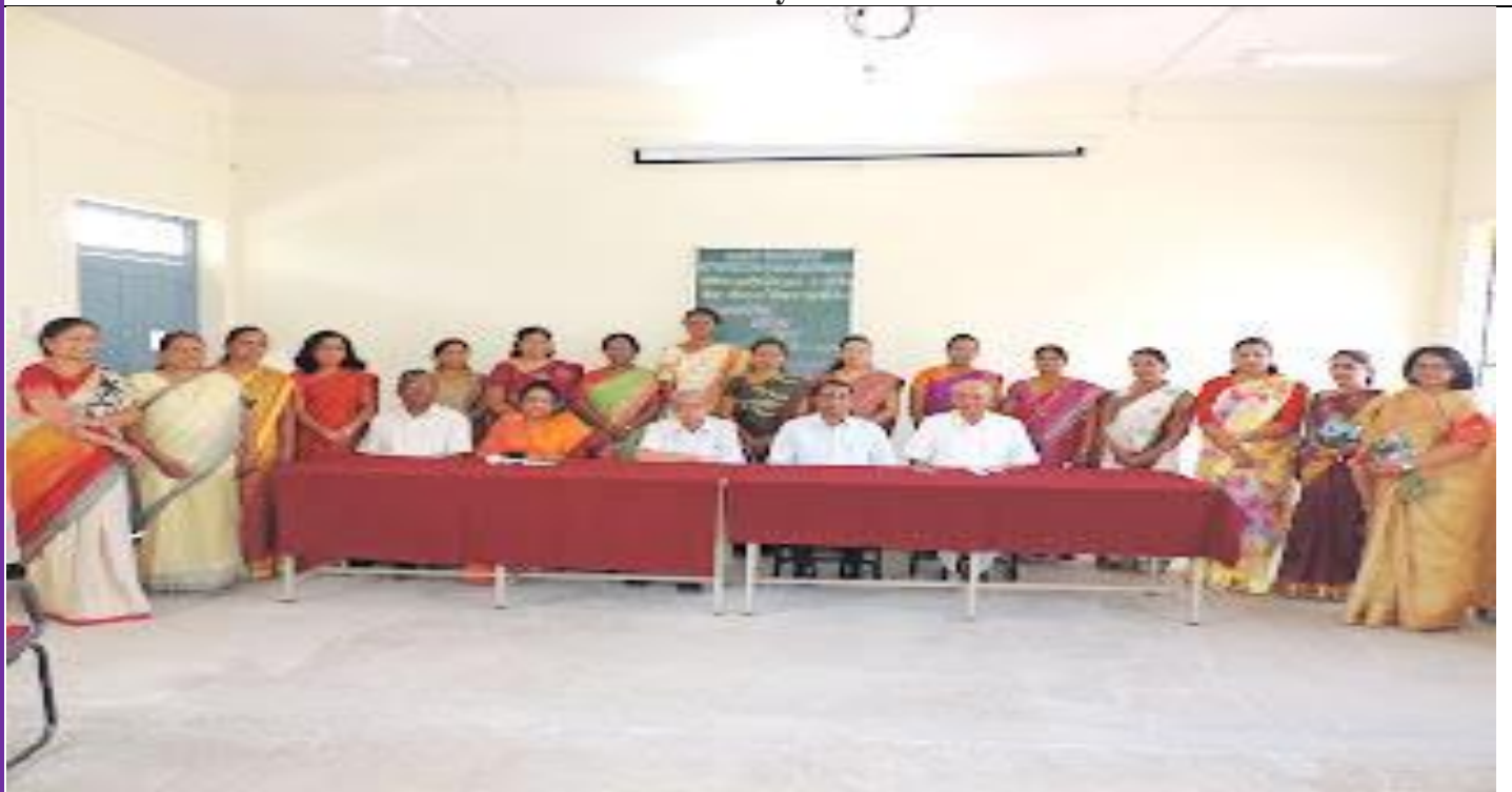
Celebrated International Women's Day -08 th March 2021