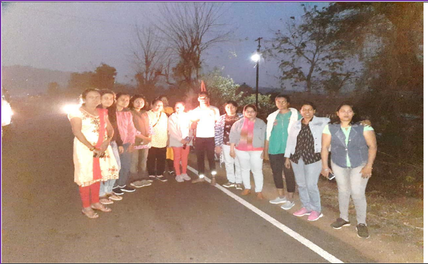
One Day Trip of Ladies Association to Ganapatipule, Ratnagiri and Welcoming "Shivjyot" 19 th February 2021