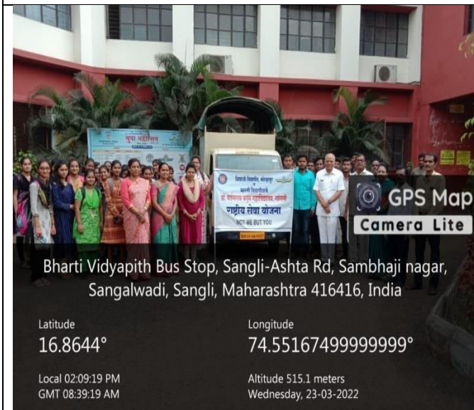
Campus Cleaning and Sapling Plantations are practiced regularly to promote environmental awareness.