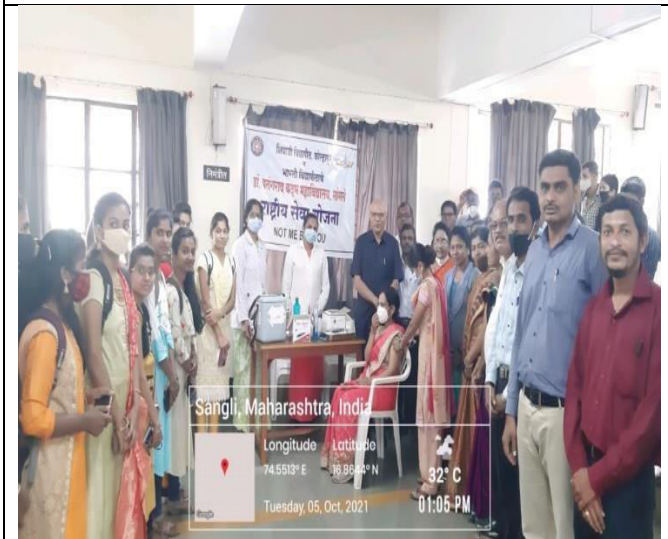
Corona Vaccination drive