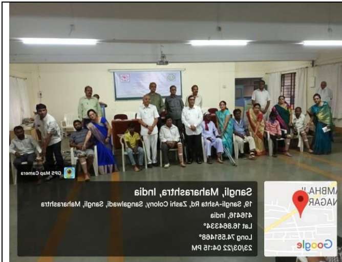
"Jaipur Foot Donation" event