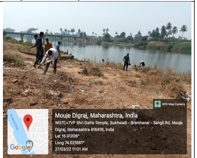
Cleanliness campaign was carried out in ghat area along the Krishna river