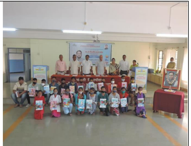
Distributed educational materials to poor and needy students