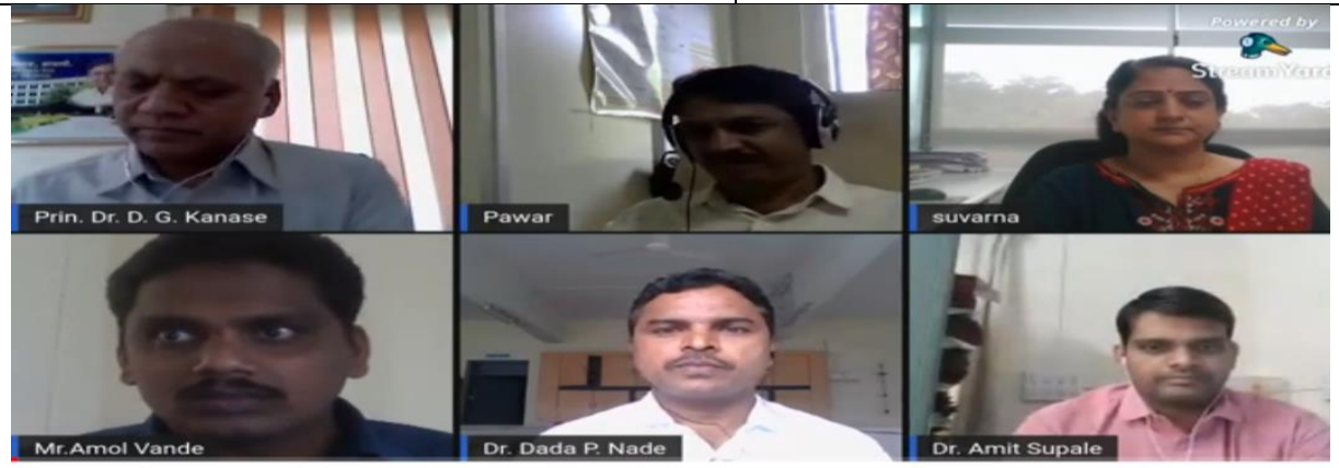
National Webinar on Ozone for Life -35 Years of Ozone Layer Protection