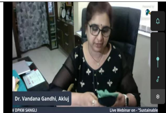
“Sustainable Menstruation and Impact of Sanitary pads on Health and Environment,