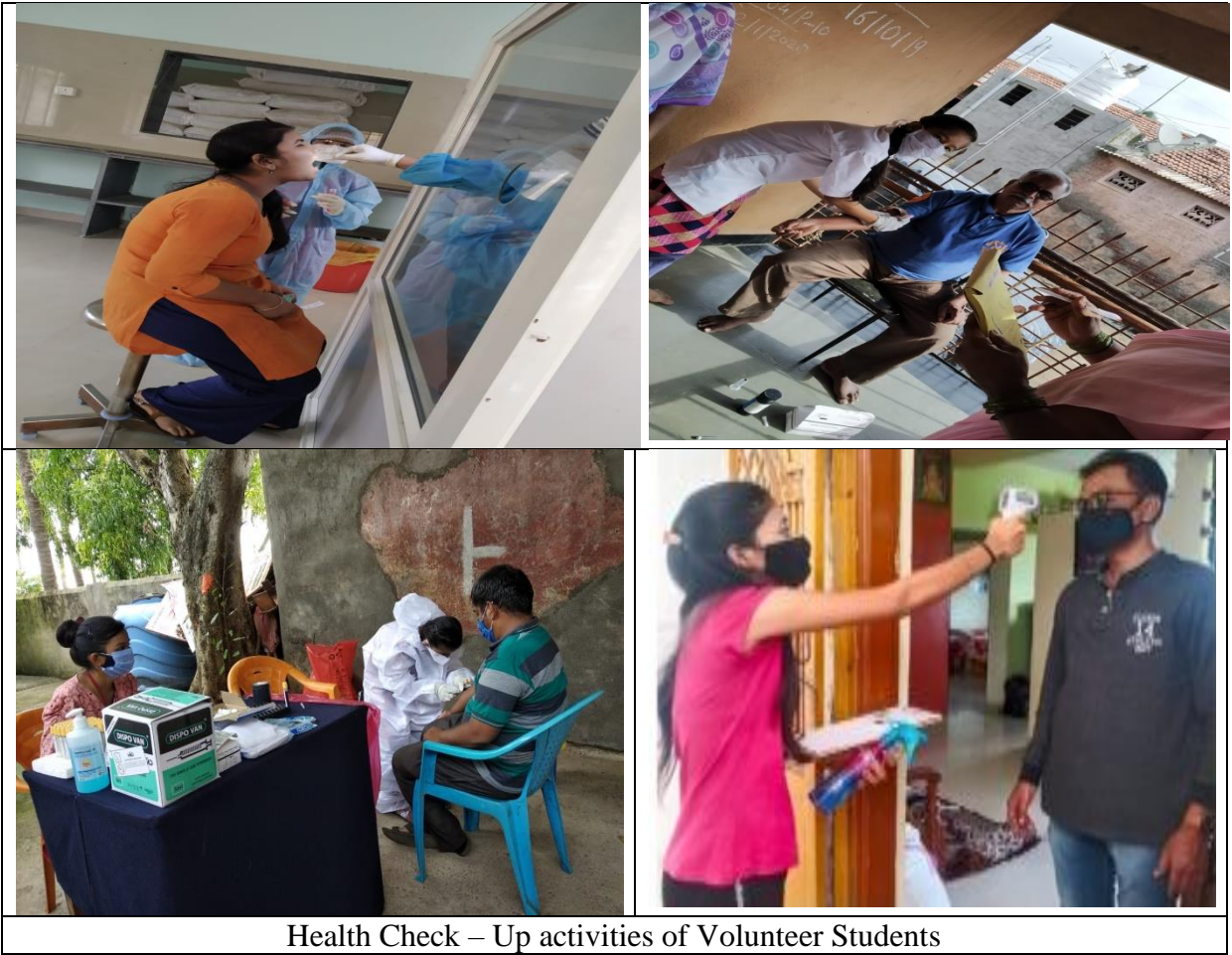
Health Check – Up activities of Volunteer Students