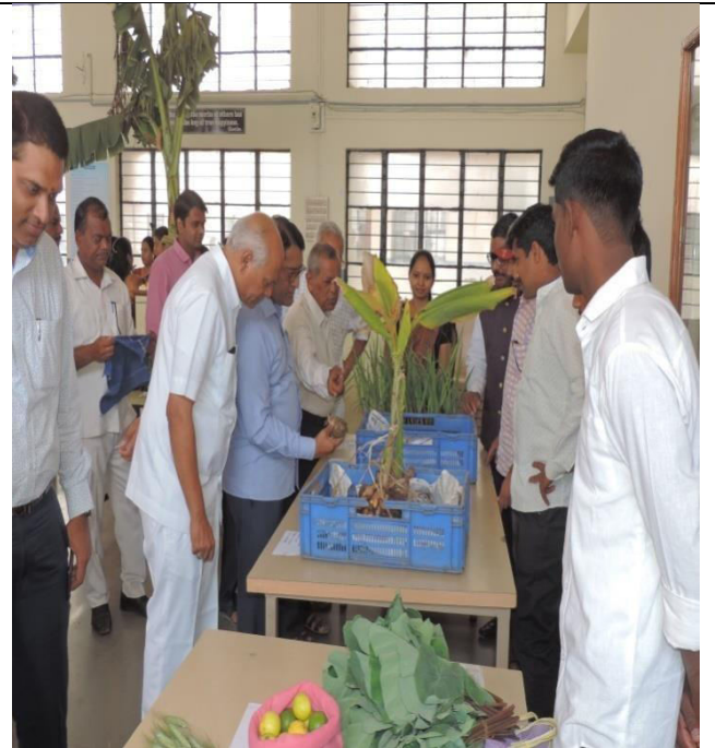
Hon. Chief guest and Hon. Principal observing saplings.