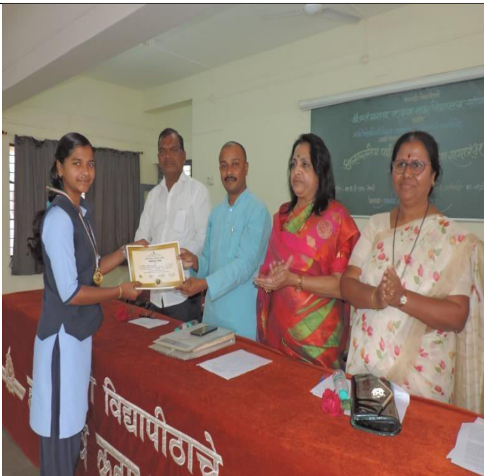
Certificate and Prize distribution