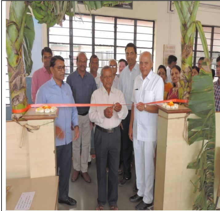
Inauguration of Farmers fair, dated on 21/01/2020