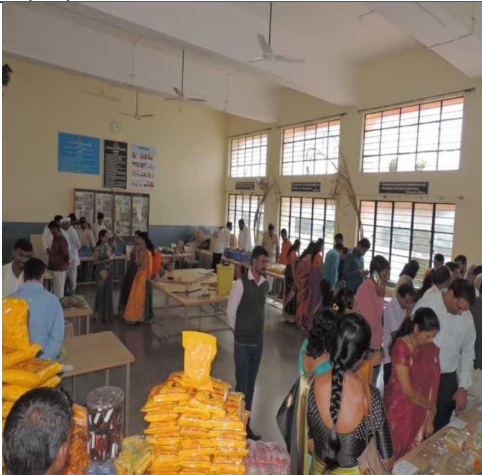
Stalls setup by farmers