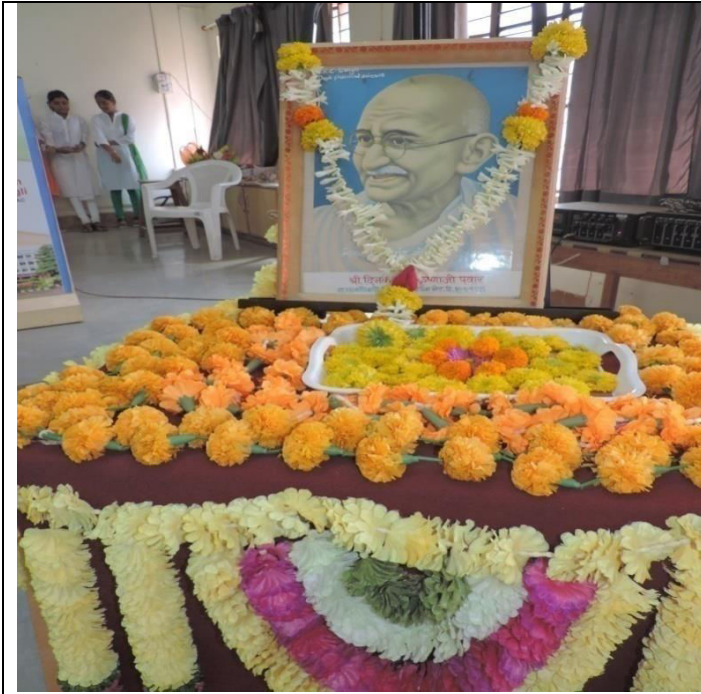
Mahatma Gandhi Thoughts Rite Exam, dated on 01 Oct. 2019