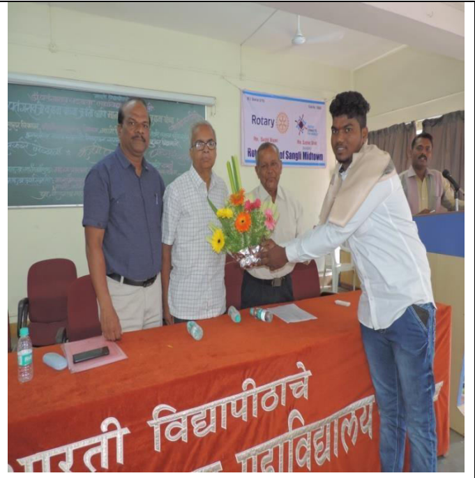
Felicitation of Farmers