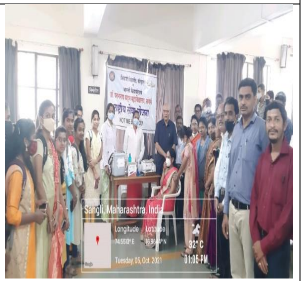
Covid – 19 Vaccination Camp