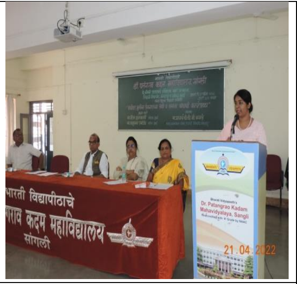
Job Opportunities in Industrial Sectors