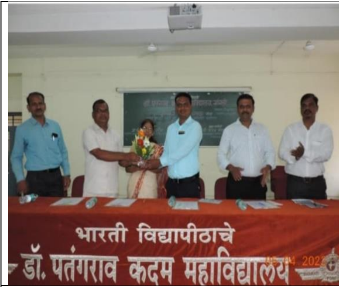
Lecture on Human Values Organized by Lead College Committee