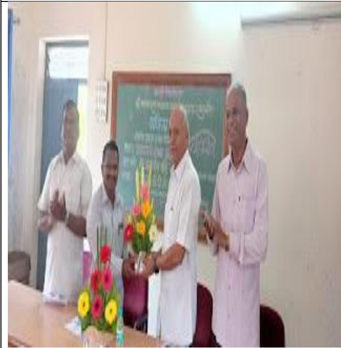
Celebration of Consumers Right Day