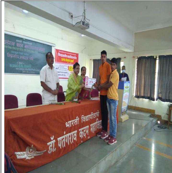
Organization of District Level T.B. Exam Competition