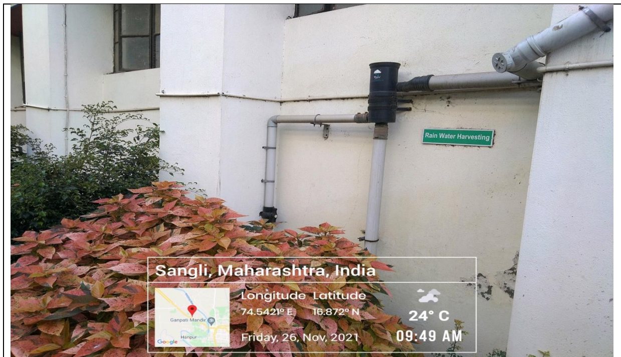
1. Rain water harvesting structures