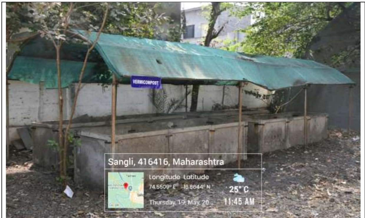
Vermi composting blocks

7.1.3: Describe the facilities in the institution for the management of the following type of degradable and non- degradable waste