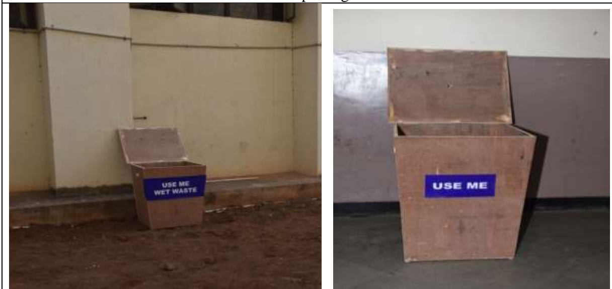
Dustbin for Wet Waste and Plastic Waste