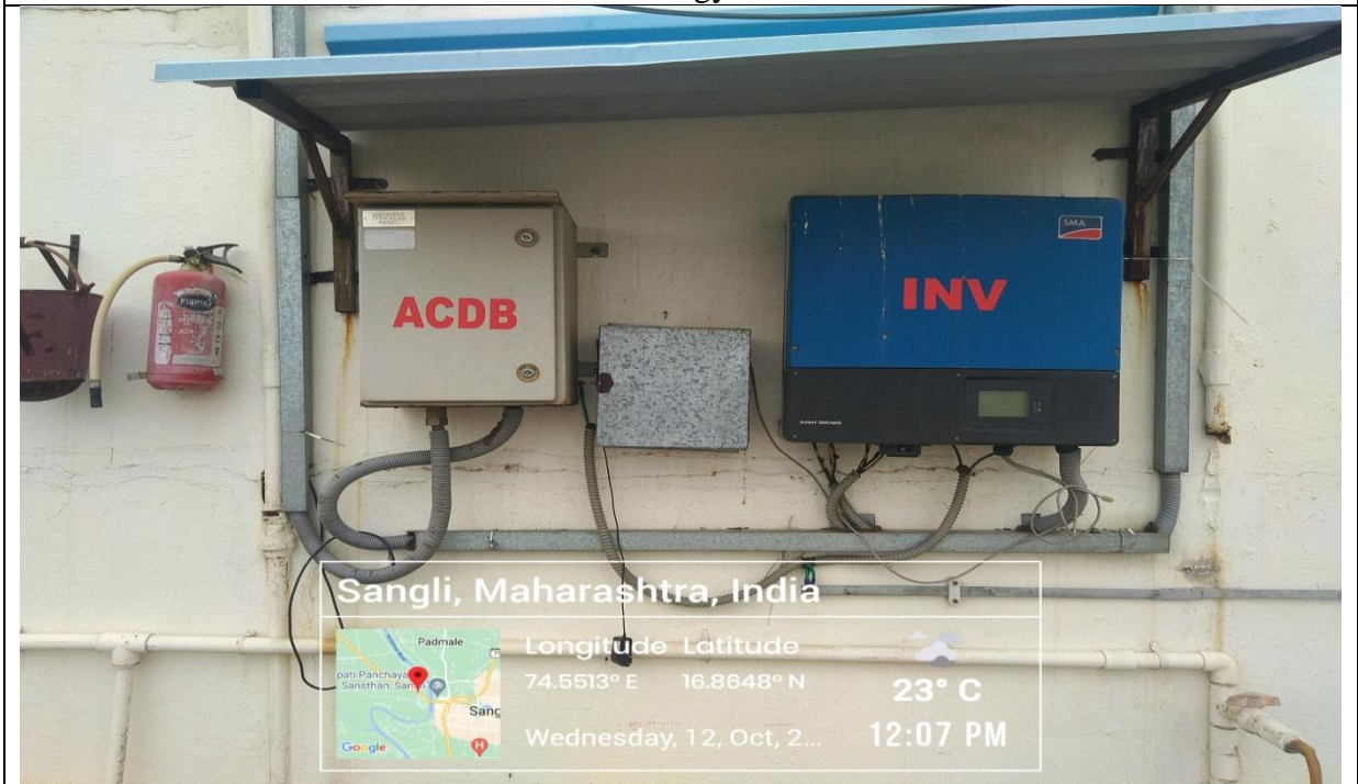
Solar Energy Panel Connected with Electricity Line