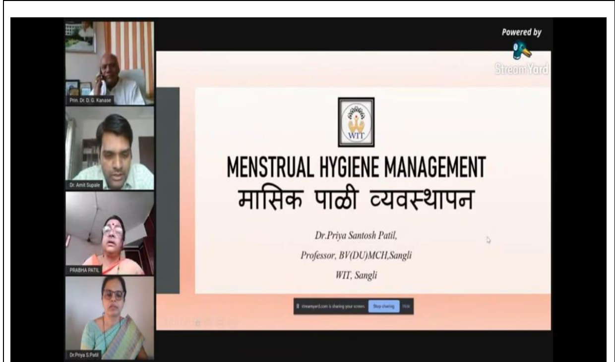
Menstrual Hygiene and Management