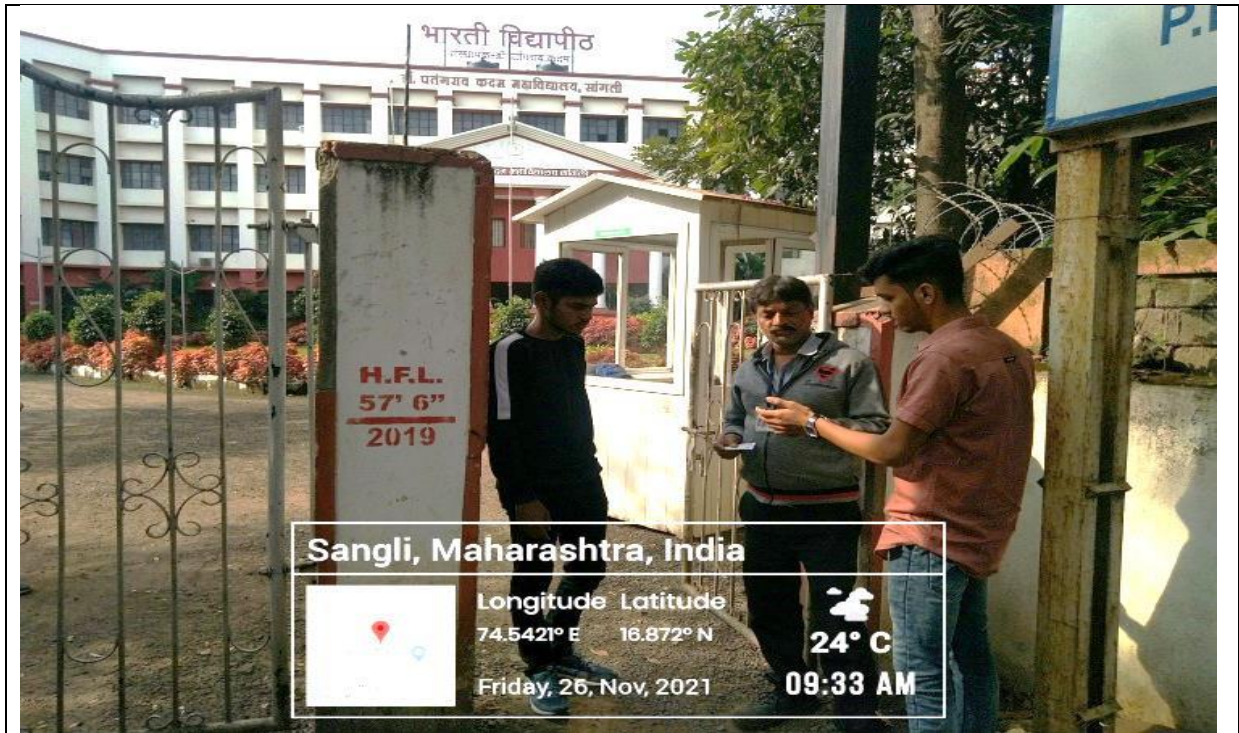
Security Guard at the Entrance