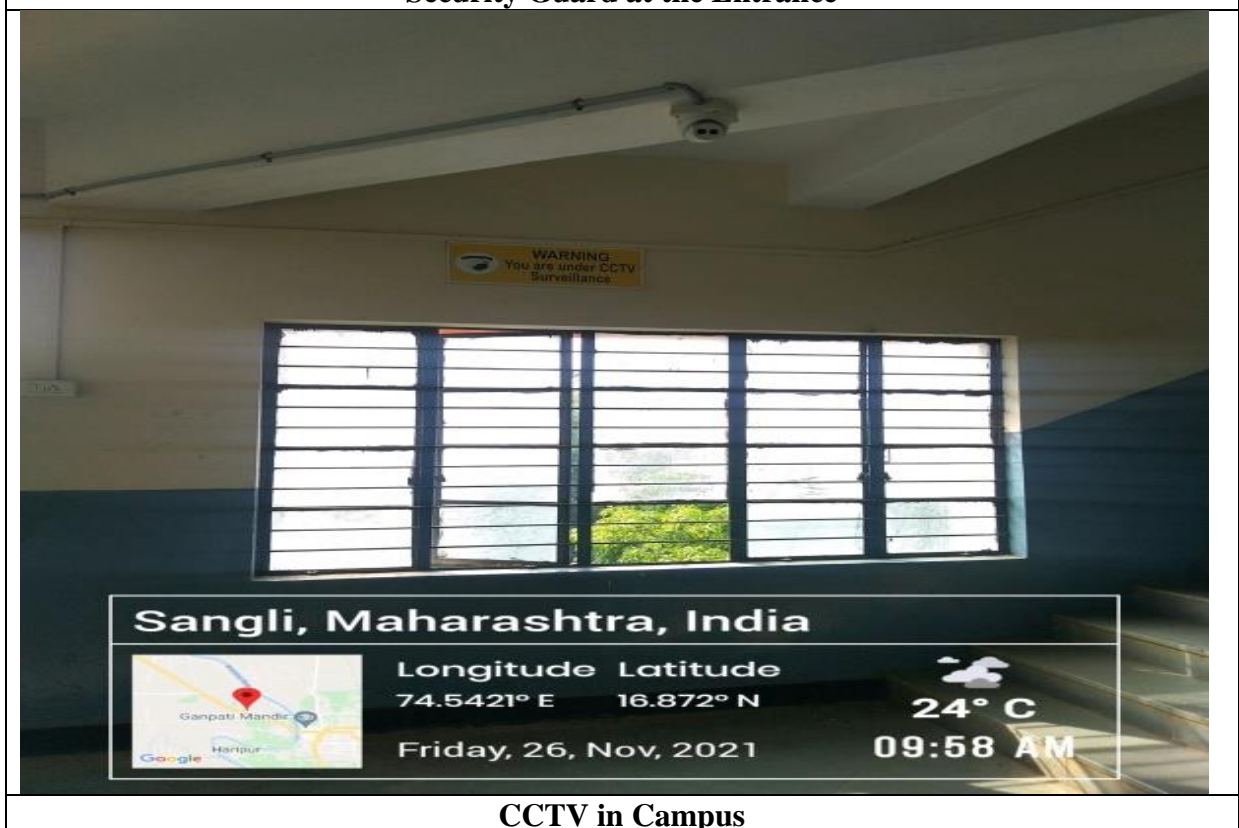
CCTV in Campus