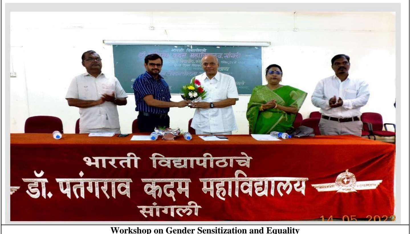
Workshop on Gender Sensitization and Equality