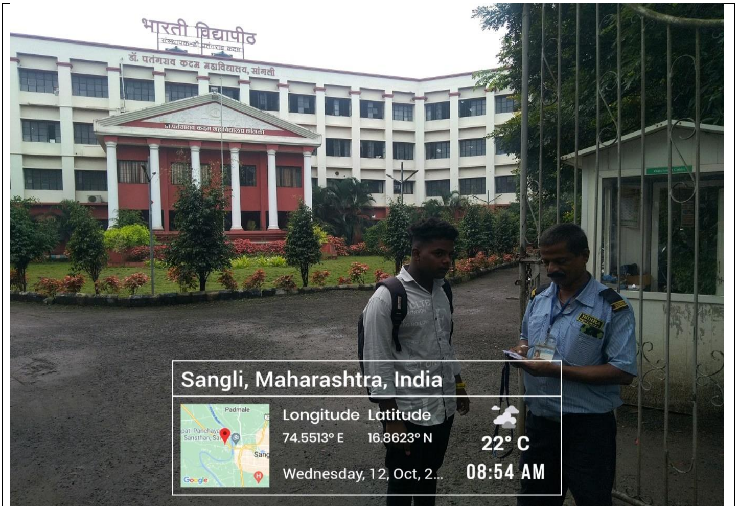
Security Guard at the Entrance