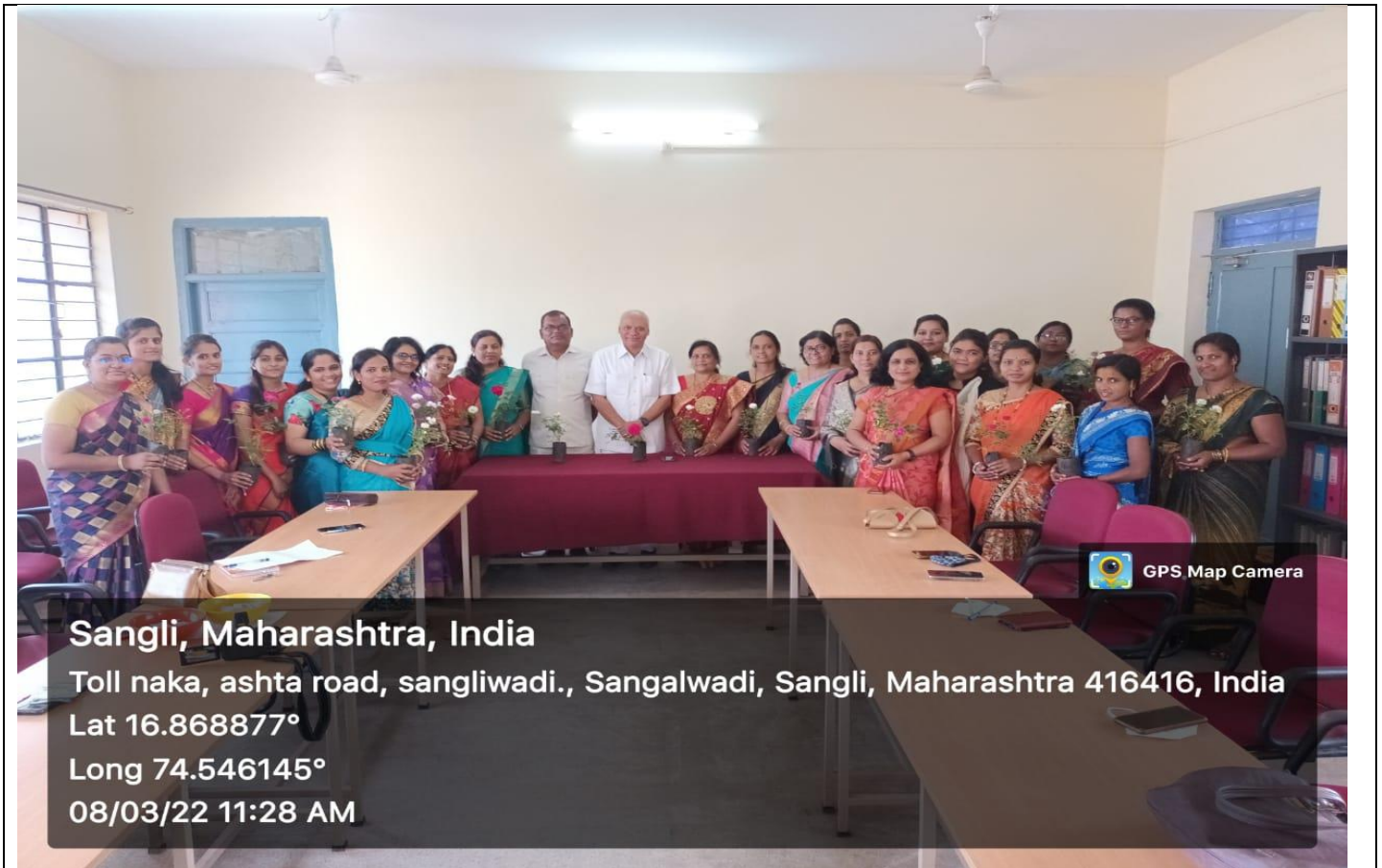
Celebration of World Women's Day