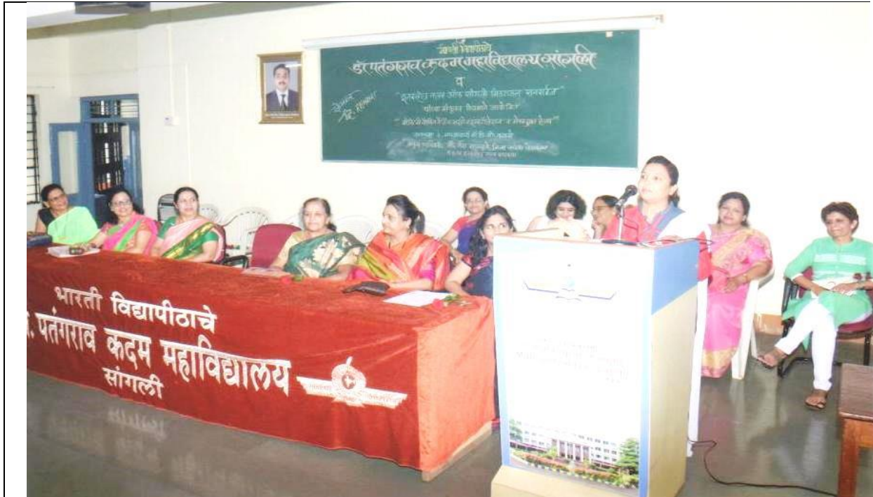
Lecture on Menstrual Hygiene on 23 rd July 2018