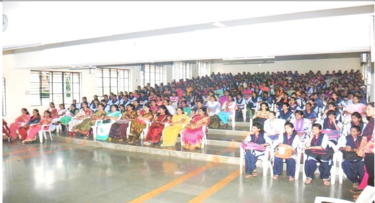
Lecture on Menstrual Hygiene on 23 rd July 2018