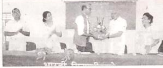
सांगली : कार्यशाळेत उपस्थित मान्यवर व अन्य.

पेथील भारती विद्यापीठाचे डॉ. पंतंगराव कदम महाविद्यालय, कै. श्रीमती शारदाबाई गोविंदराव पवार अध्यासन, शिवाजी विद्यापीठ, कोल्हापूर व 'महिका' मुंबई यांच्या संयुक्त विद्यमाने पदवीधर मुलींना रोजगाराच्या संधी व क्षमता बांधणी